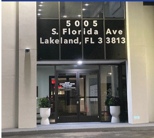
Entrance to NavJay Professional Center

Amenities: 24-Hr private security access, birch-wood doors with glass panel, large bay windows, individual mailbox, Wi-Fi + 2 hard-wired lines per office, breakroom, conference room with dual Smart TV's for presentations & more.